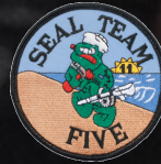
SEAL TEAM 5