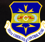
505 TH COMMAND & CONTROL WING