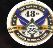
48 TH CIVIL SUPPORT TEAM